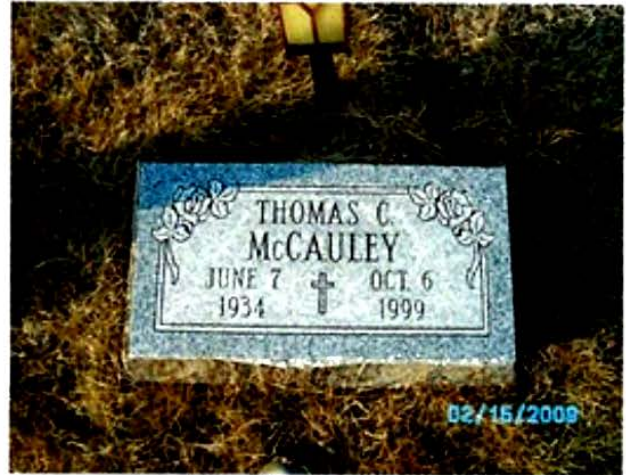
Added by: Casseopias

Created by: Casseopias Record added: Apr 16, 2009 Find A Grave Memorial# 35945456